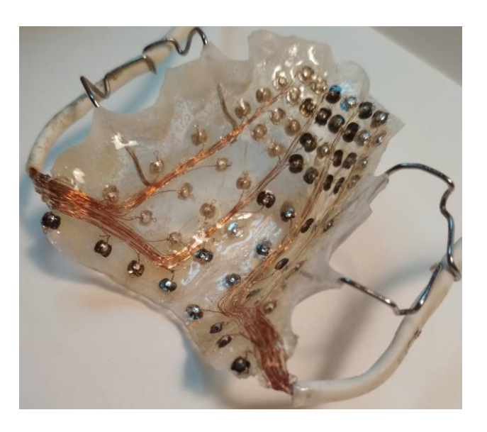
Figure 1: Original palate with anatomical layout of contact sensors

In our approach (Figure 1), only one layer of conventional two-component acrylic is used. The